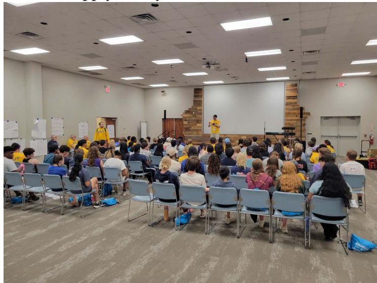
table at DisCon this year, so bring us your questions and support. We'd love to see even more students apply next year!