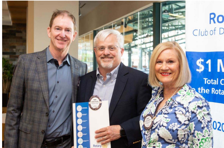
Announcement By: De Cutshaw Re: Free Learning Seminar + After-Hours